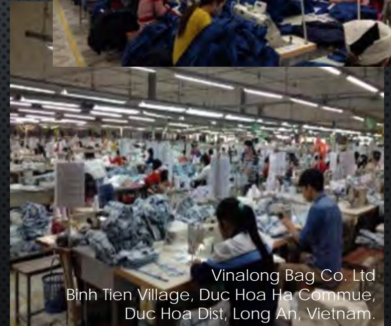
Vinalong Bag Co. Ltd Binh Tien Village, Duc Hoa Ha Commue, Duc Hoa Dist, Long An, Vietnam.